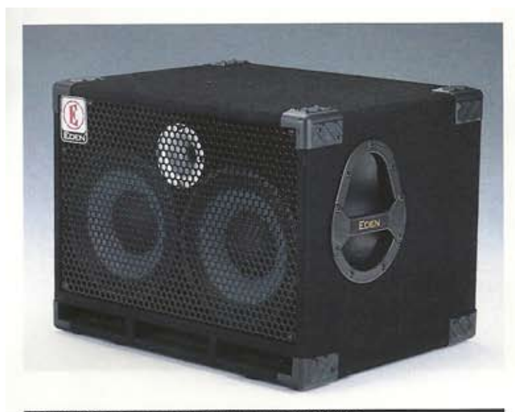
The EN210XST cab comprises two 10-inch paper cone speakers